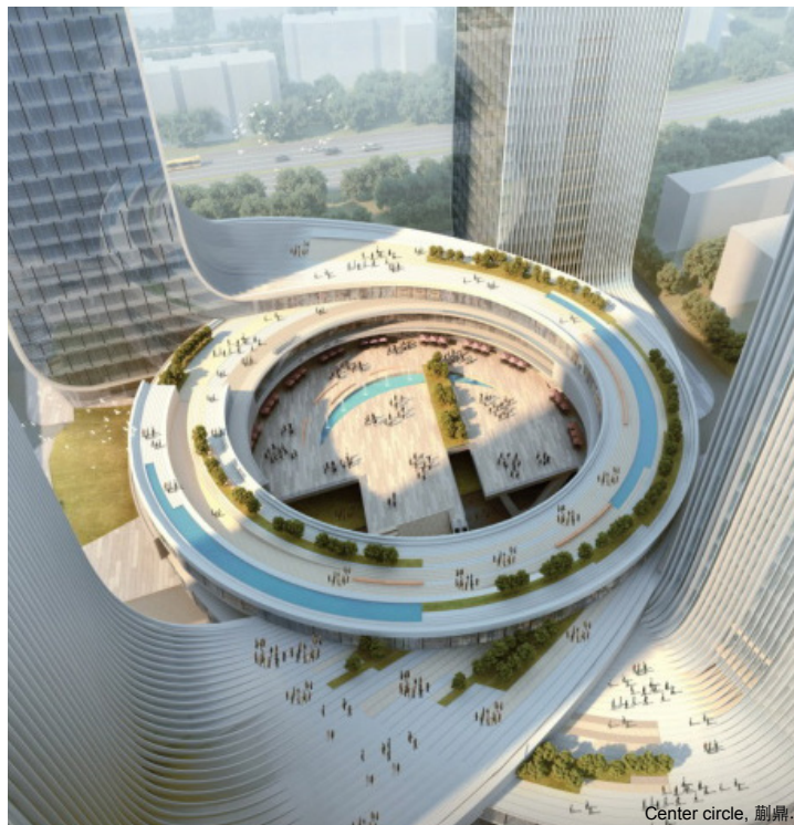
Center circle, 劇鼎.