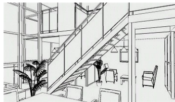
Architectural Interior, François Letourneau.

McNeel Europe · www.rhino3d.com · +34 933 199 002 · sales.eu@mcneel.com