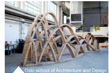
Oslo school of Architecture and Design